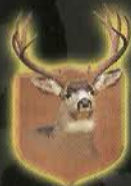
WHITETAIL & MULE DEER