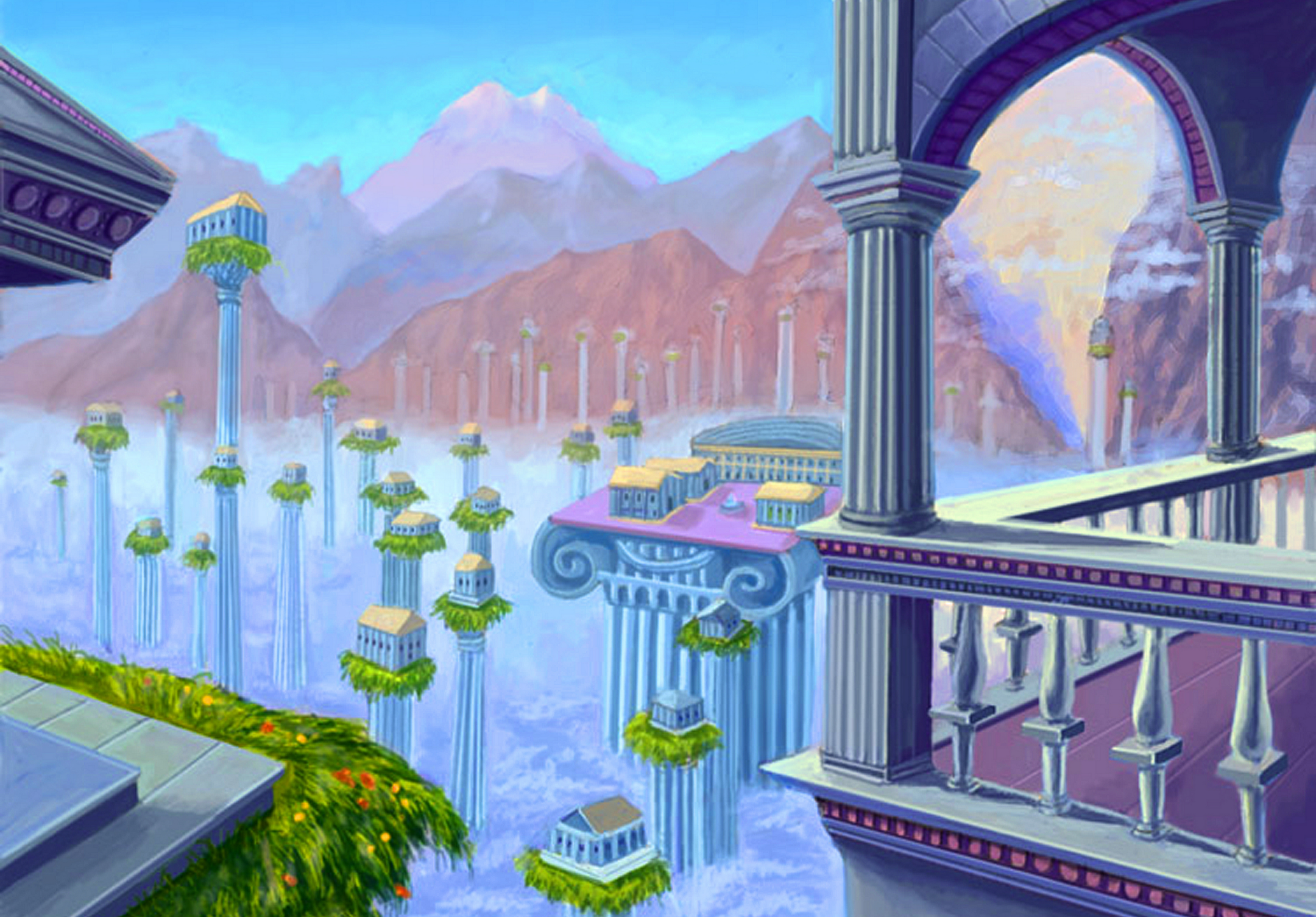
The City of the Winged Ones