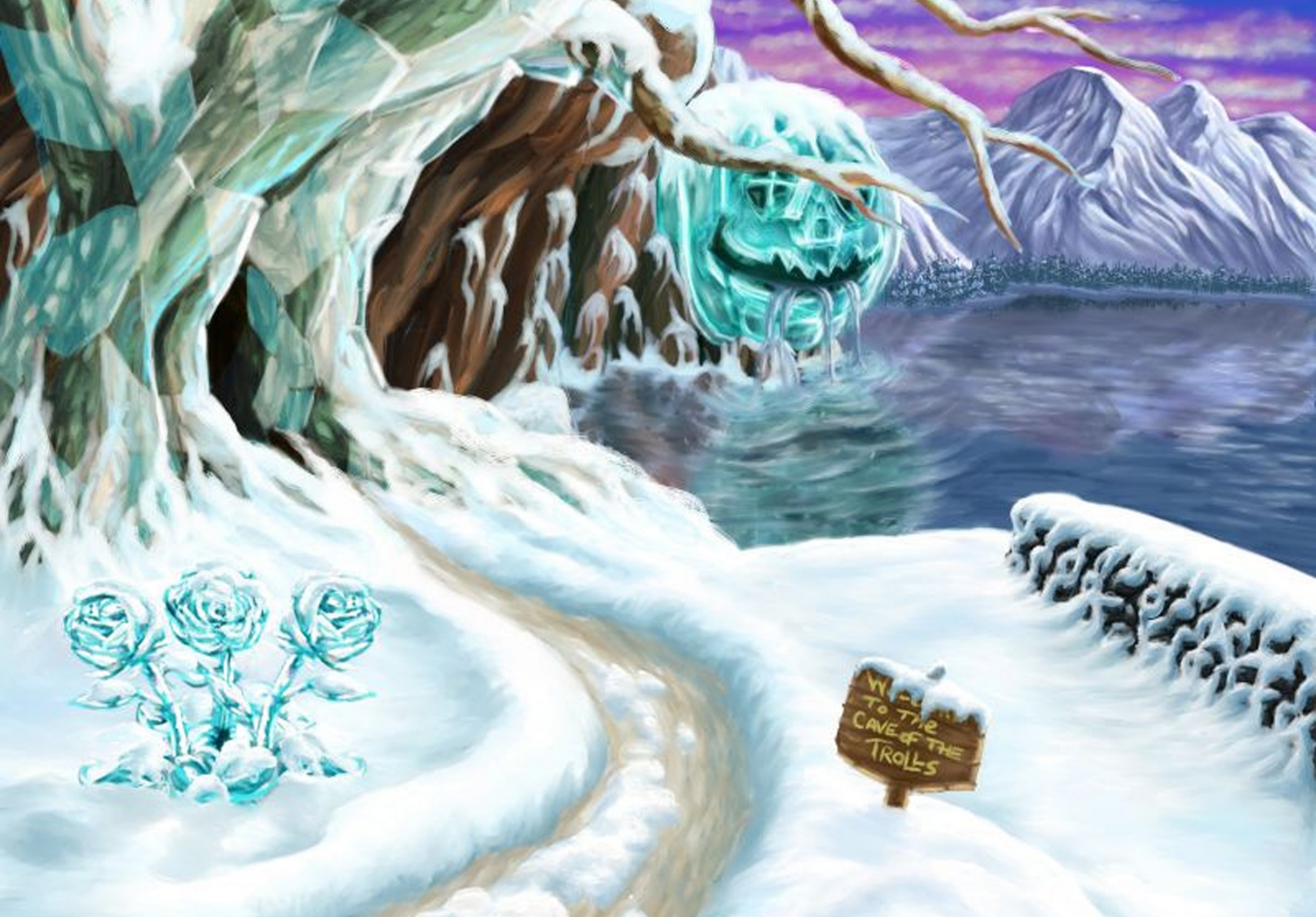
Frozen Ooga Booga