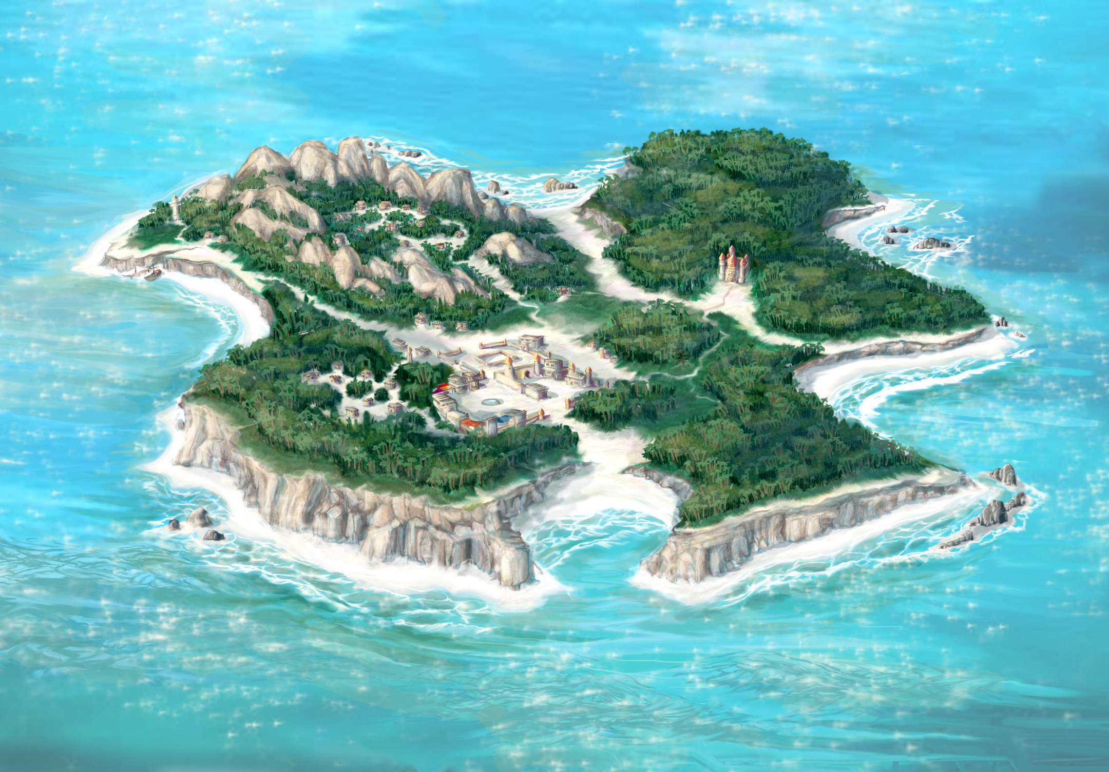
The Isle of the Crown by Tracie Schmidt