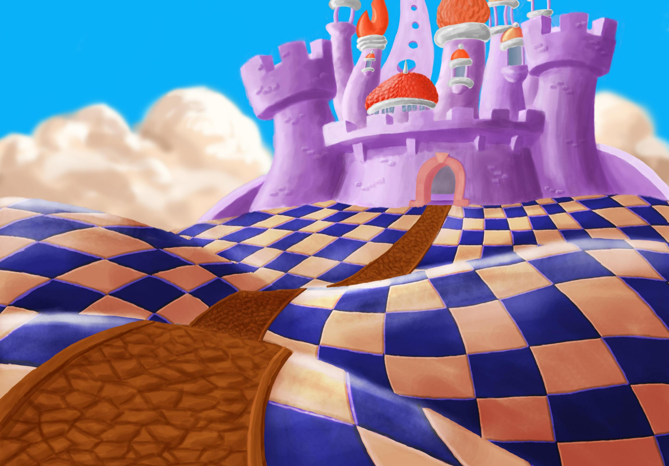
The Hills of Chessboard Land