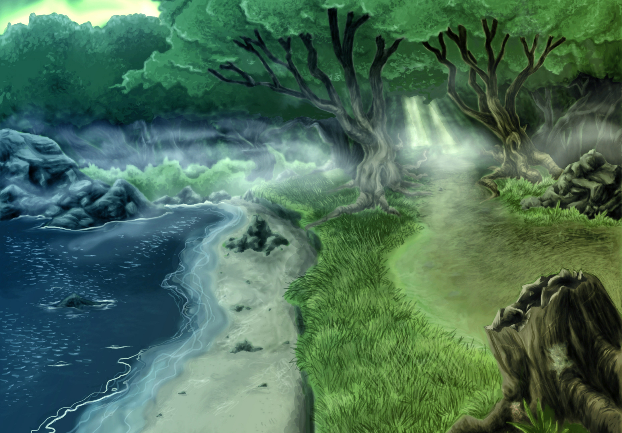
The Entrance to the Mist Forest