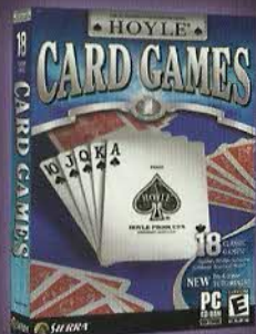
Hoyle® Card Games