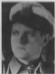
Erich Topp, C.O. of U-552, the Red Devil Boat

M embership in Sharkhunters offers several benefits: annual conventions in the U.S. and Europe, expeditions, local meetings, and diving trips. And best of all, membership includes a subscription to the monthly KriegsTageBuch magazine, named after the War Log Book,