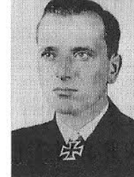
Otto Kretschmer, C.O. of U-99

The KTB is used extensively as a reference by many historical groups, including the National Archives and the Library of Congress in Washington, D.C.; the Museum of